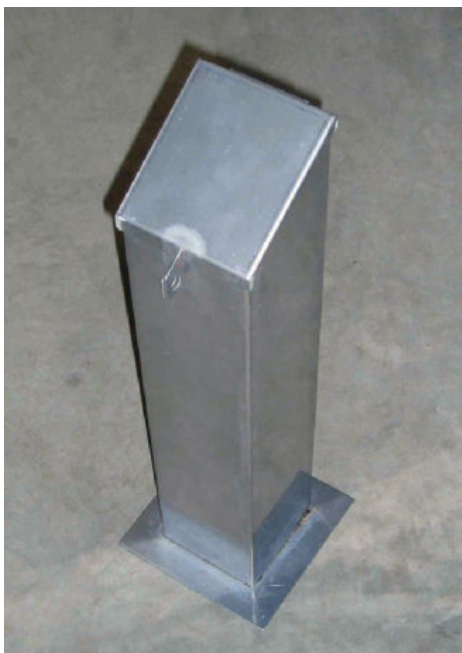
Well Protection Box